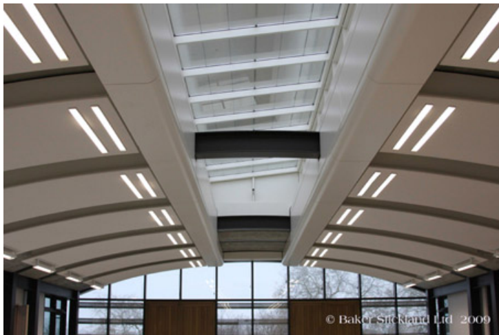
Curved monolithic acoustic rafts utilising StoSilent on a bespoke Baker Stickland grid system, finished with Sto Superfine spray applied finish.

Pre-formed aluminum painted clip on, and accessible, panel system providing services ducting around this roof light.