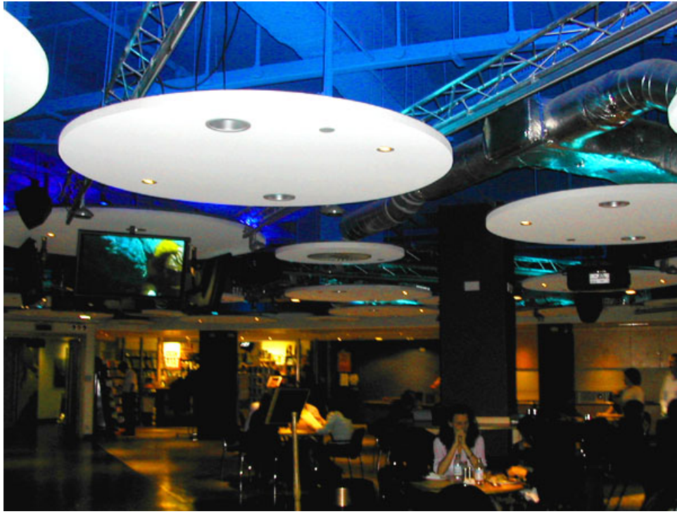
Sto circular rafts installed in the restaurant area of the BBC London studios.